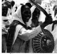
Eritrean woman celebrates independence

The AIDS research and the filmmakers' personal experience become ultimately indistinguishable. Through their journal entries, the women document their questions and face their inadequacies, which catapult them into unknown areas of their own lives. A transformation in understanding AIDS and its realities becomes apparent: no one is immune to the effects of AIDS, physically or inwardly.